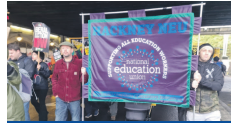
Our banner on the 30,000-strong protest in London on 5th November (below) against the cost of living crisis and demanding a general election.